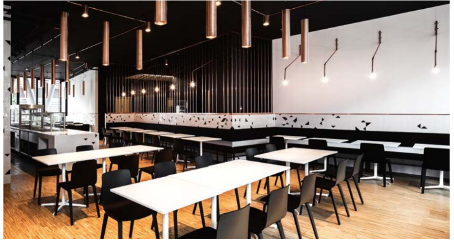
1 Bistro Luna Sofia, Bulgaria Art. 3910 Art. 0965 Fred