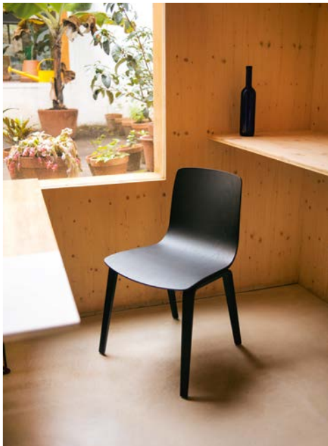
4 Art. 3910